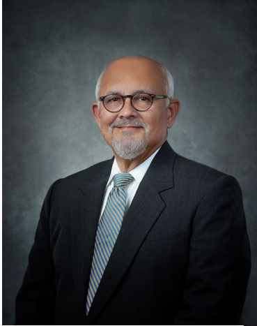
Mayor John Escoto City of Shenandoah